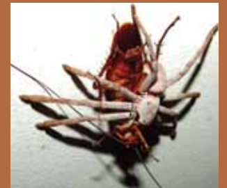
A huntsman spider that caught a cockroach.

In 2006 a new type of Huntsman was discovered. It's called the Tiger Huntsman and is bright orange it's also one of the largest Huntsman, but don't worry so far it's only been found in a small area of far north Queensland.