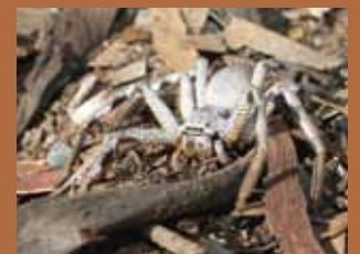
A huntsman spider in leaf litter.