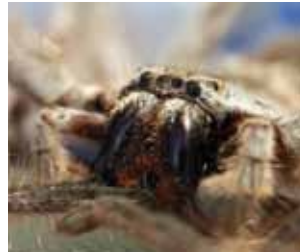
Huntsman spider venom won't hurt us.